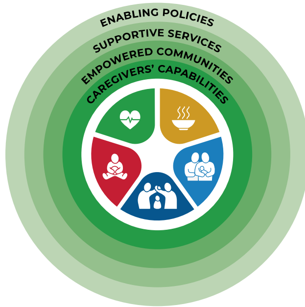
Figure. Enabling environments for nurturing care (7).

The next four parts of this brief suggest actions you can take to foster men's engagement in each of the four enabling environments for nurturing care (See Figure).