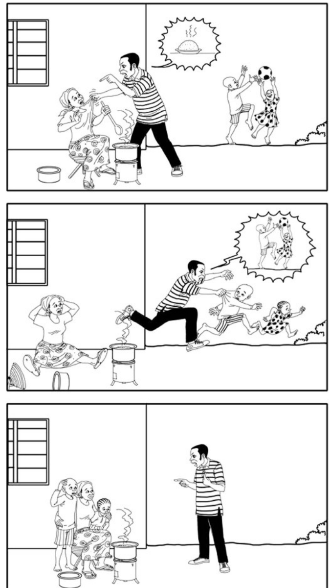
Fig. 1. FGD Vignette-1 (Illustrator: Marco Tibasima).

All FGDs and IDIs were audio recorded (with prior consent) and fully transcribed and translated using a two-stage process. Transcriptions were spot checked by a research assistant and subsequently uploaded to Atlas-ti 7.5 (2016). We used a five-step framework analysis approach to analyze the data, including: familiarization, developing a thematic framework, indexing, charting, and mapping and interpretation (Ritchie and Spencer, 2002). We first familiarized ourselves with the data through reading, organizing and initial memoing that continued into indexing. We developed an a-priori codebook (based on pilot research) which was revised to accommodate emergent codes. Transcripts were coded line-by-line and simultaneously organized into frameworks corresponding with core research questions. During mapping and interpretation we summarized coded data on broader thematic levels, developing additional matrices and a conceptual model to describe key findings. While field notes from the participatory exercises were appended to the transcripts and reviewed during coding, these outputs were not systematically included in the current analysis.